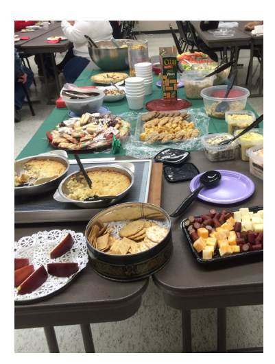
Some of the food at the 2015 Holiday Party.