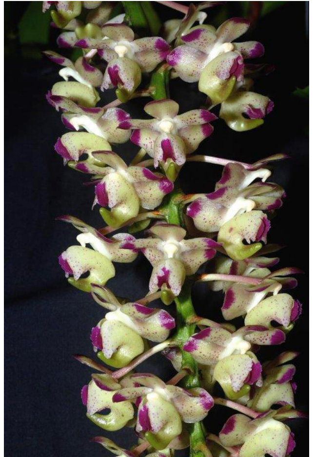
Aerides quinquevulnera , 'Prince's Passion JG,' AM/80 points, owned by John Gross. Plant held 124 flowers and 110 buds on 5 inflorescences.