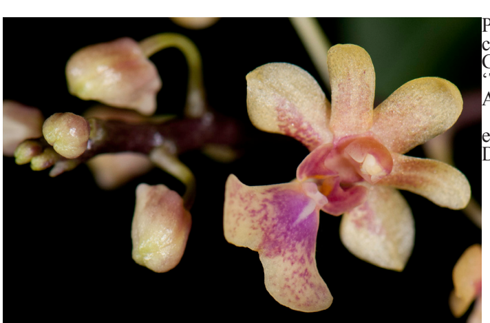
Phalaenopsis Orchid Classic's Golden Showers 'Tiny Tot,' HCC/ AOS,