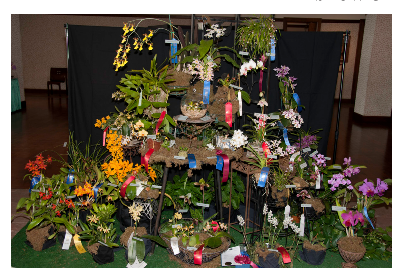
American Orchid Society Show Trophy winner: Orchid Society of Greater Kansas City