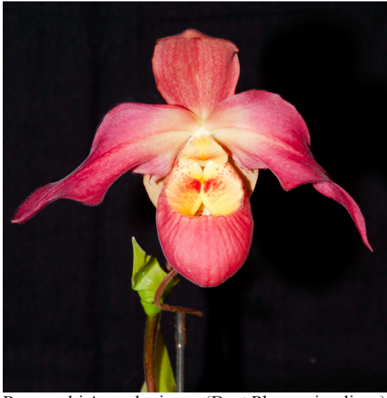
Pyrzynski Award winner (Best Phragmipedium) Phrag. kovachii X Living Fire (Iowa Orchids)