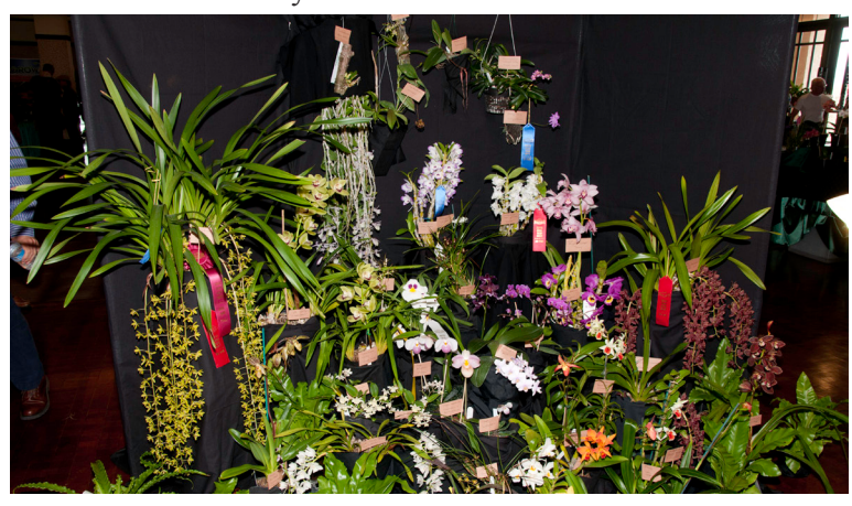
The Greater OMaha Orchid Society display.