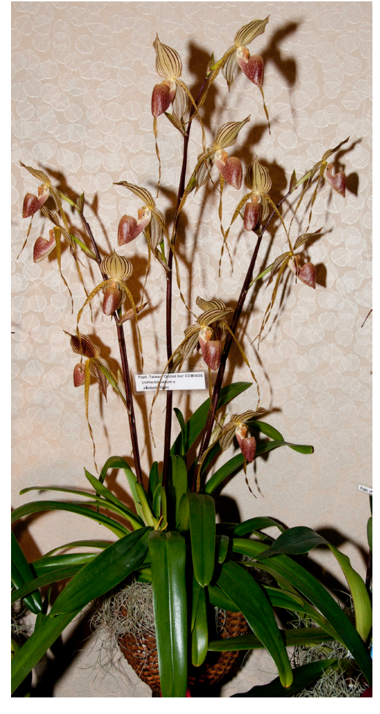
Winner of the President's Award: Paphiopedilum Taiwan (Orchid Inn USA display).