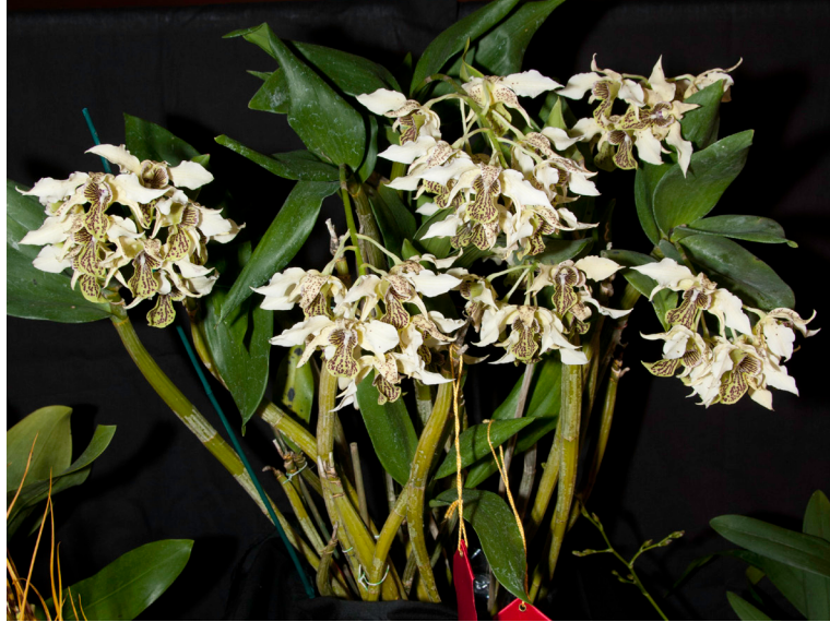
The Greater Omaha Orchid Society Memorial Award winner (best Dendrobium): Dendrobium atroviolaceum X pygmy atroviolaceum 'H & R' (Iowa Orchids)