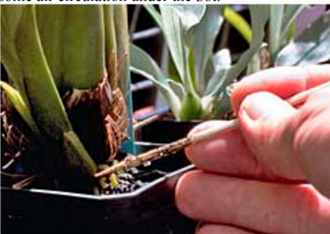
Use a pencil or wooden skewer to determine whether an orchids needs to be watered.

Water your orchid early in the morning. This insures complete water evaporation on the foliage as well as the crown by nightfall. If your home is very warm or has low humidity you will most likely need to water more often. The best place to water your plant is in the kitchen sink. Use lukewarm water (do not use salt softened or distilled water) and water your plant for about 15 seconds and be sure to thoroughly wet the media. Then allow the plant to drain for about 15 minutes. It may appear dry but it has had enough water. After the plants are watered, they should be placed so that the pots do not stand in water. Some people like to place the pots on "humidity trays" or in trays or saucers of gravel or pebbles and water. The pot is placed on the pebbles above the water line. This helps to insure that the base of the pot is not immersed in water, increases humidity for the plant, and provides some air circulation under the pot.