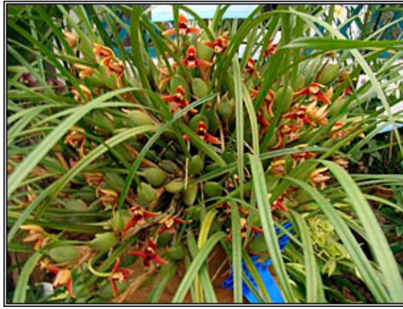
Maxillariella tenuifolia (Lindl.) M.A.Blanco & Carnevali

Like Brassavola nodosa , Maxillaria tenuifolia is one of those orchids that belongs in every collection. While small plants remain compact, it may also be grown into a specimen in a rather short period of time. The grasslike foliage makes an attractive houseplant even when not in flower. Being a widely distributed species, it is adaptable to a broad range of growing conditions. Also known as the “coconut orchid”, this Maxillaria will perfume the home or greenhouse with its coconut-scented flowers and delight family and visitors.