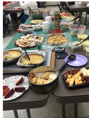
Some of the food at the 2015 Holiday Party.