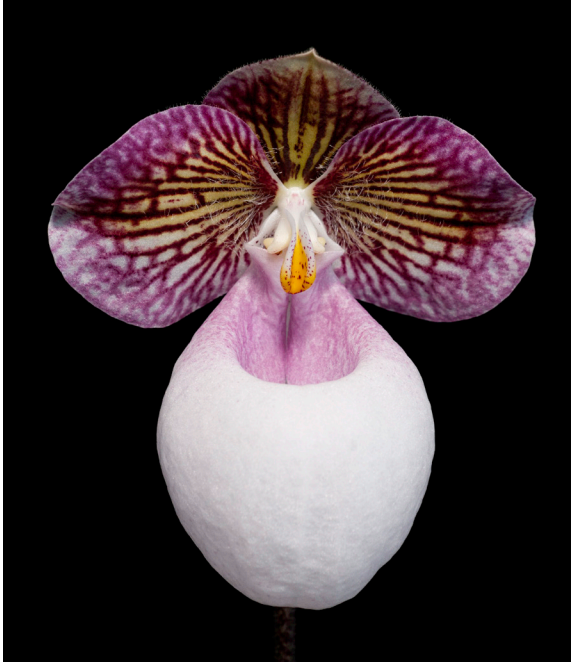
Paphiopedilum micranthum var. eburneum 'Perfecto' AM/86 pts, Exhibitor: Orchid Inn