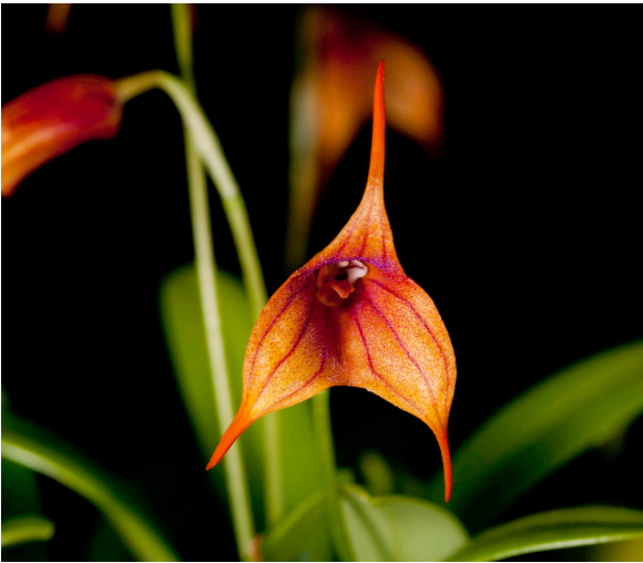
Masdevallia Fred Bergman 'Lauritzen Gardens' AM/82 pts