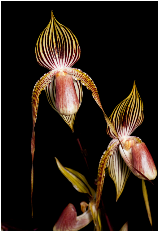
Paphiopedilum ( Predacious X rothschildianum ) 'Zach' AM/80 pts Exhibitor: Orchid Inn