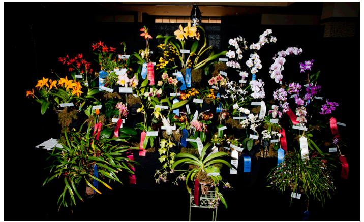
Orchid Society of Greater Kansas City Exhibit SC/86 pts & ST/86 pts AOS Show Trophy