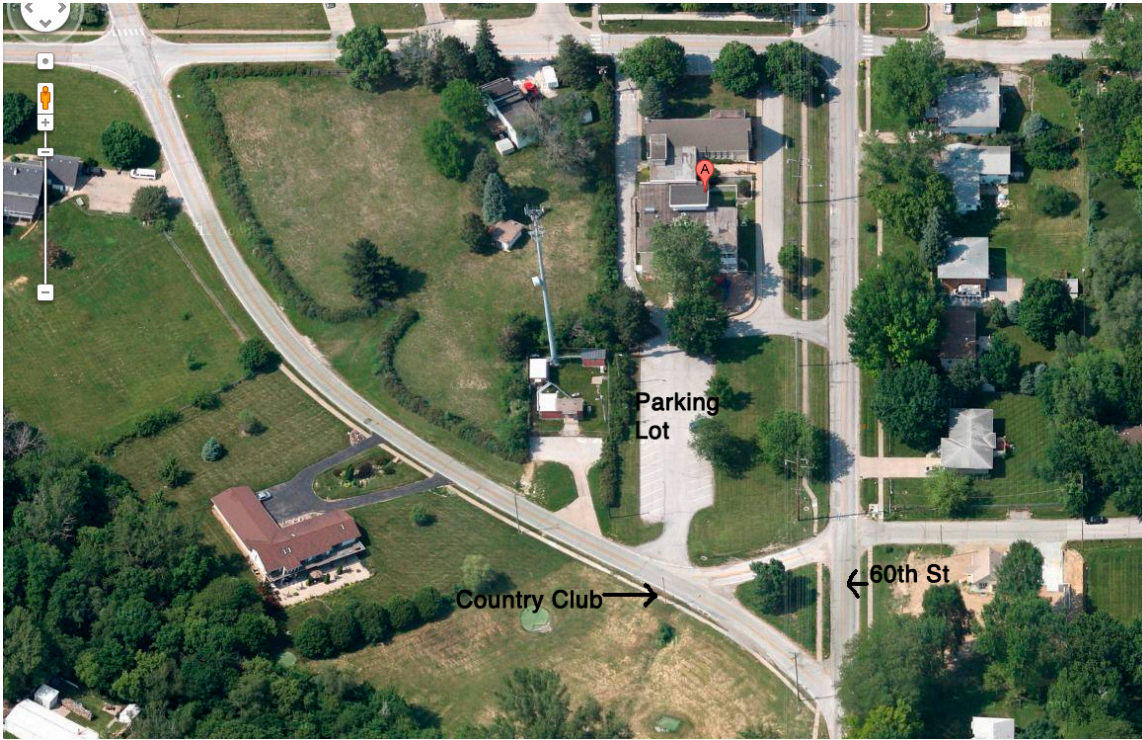
Detail of Olive Crest United Methodist Church area. "A" is the church building, Note the locations of the church parking lot, Country Club, and 60th St.