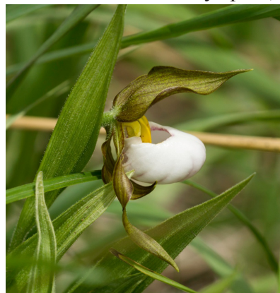
Small White Lady's Slipper ( Cypripedium candidum).