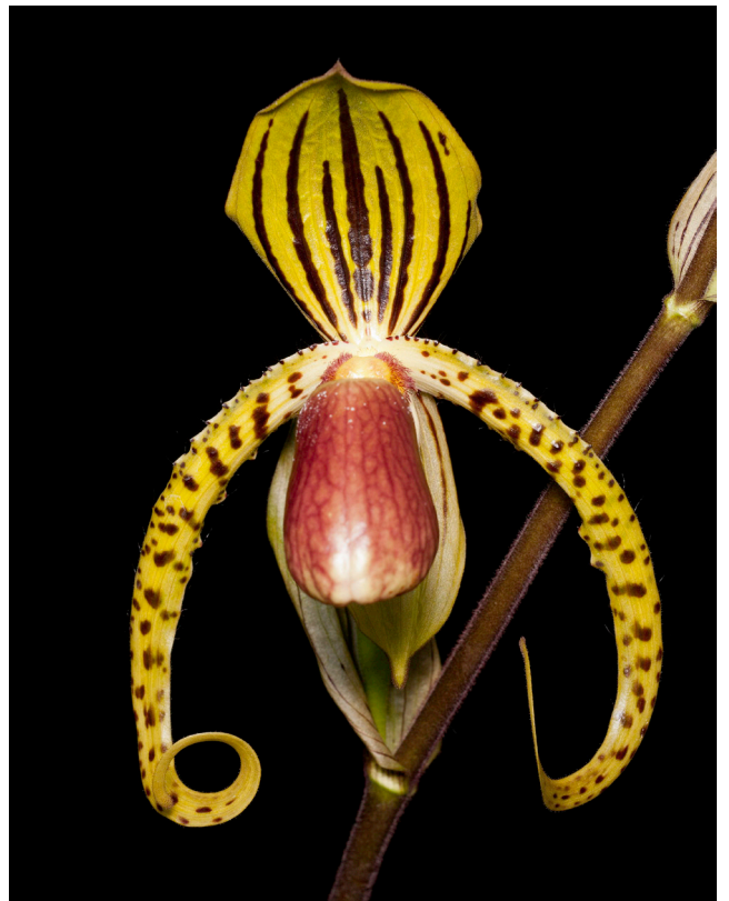
Paphiopedilum (supardii X gigantifolium) HCC/78 pts., Exhibitor: Orchid Inn Provisional award pending registration by RHS