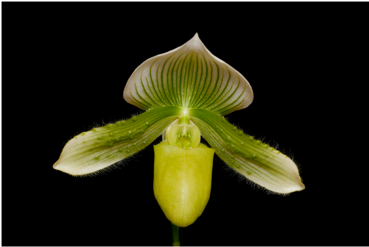
Paphiopedilum Hilo Key Lime, HCC/75 pts. Exhibitor: Orchid Inn