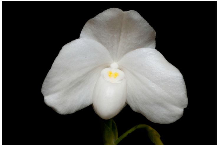
Paphiopedilum (Double Gray X Pagoda Dell) HCC/76 pts., Exhibitor: Orchid Inn