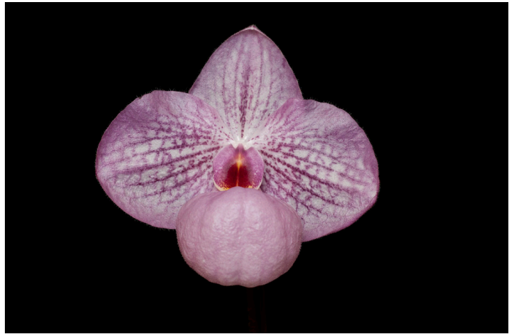
Paphiopedilum Magic Lantern, AM/84 pts. Exhibitor: Orchid Inn