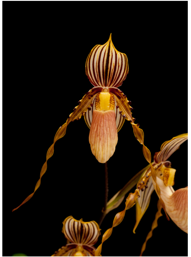
Paphiopedilum glanduliferum, AM/81 pts. Exhibitor: Orchid Inn