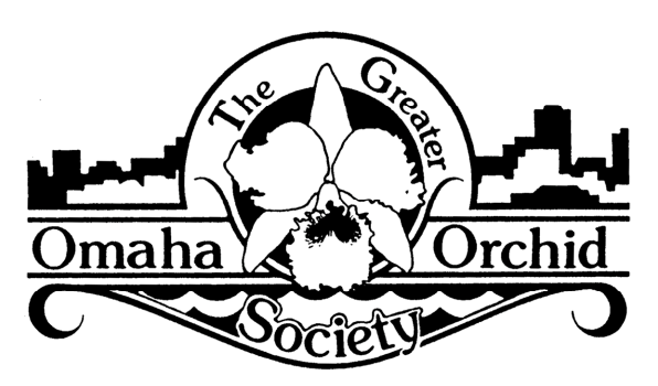
greateromahaorchidsociety.org December 31, 2012